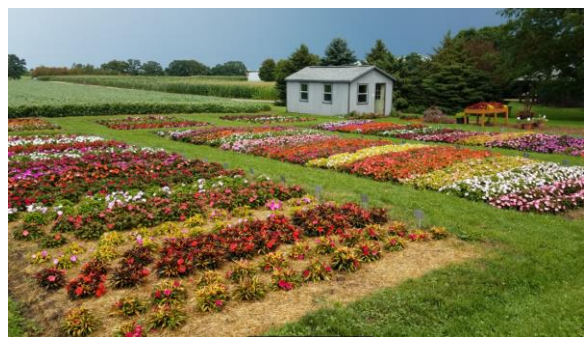
Three of the nine beds of Impatiens trials